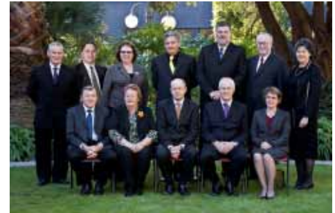
WHAKATANE DISTRICT COUNCIL, 2004-07