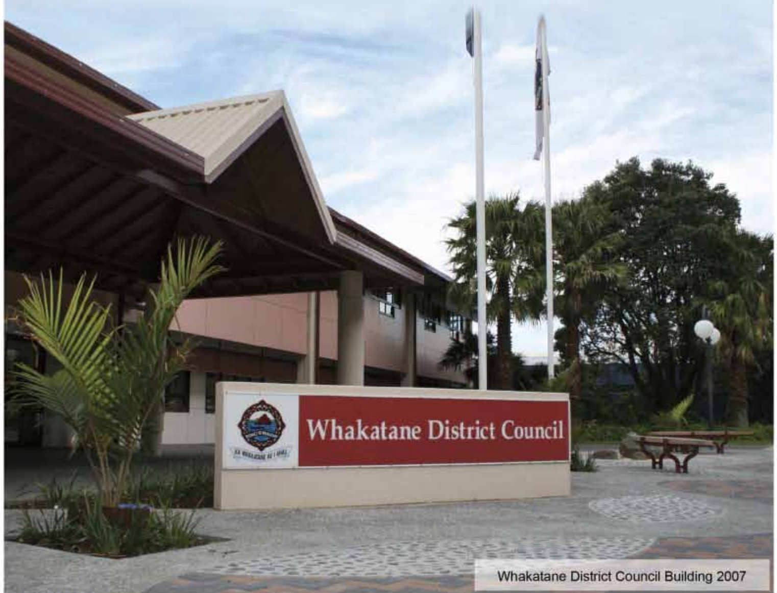
Whakatane District Council Building 2007