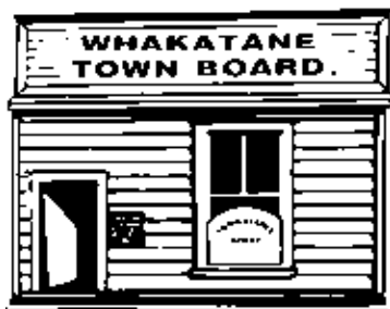
Whakatane Town Board