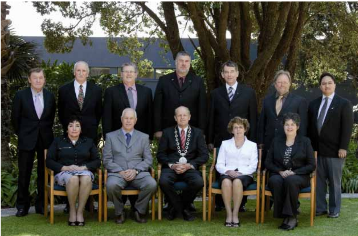
Whakatane District Council 2007-2010