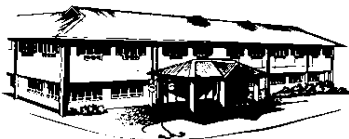
Whakatane Civic Centre