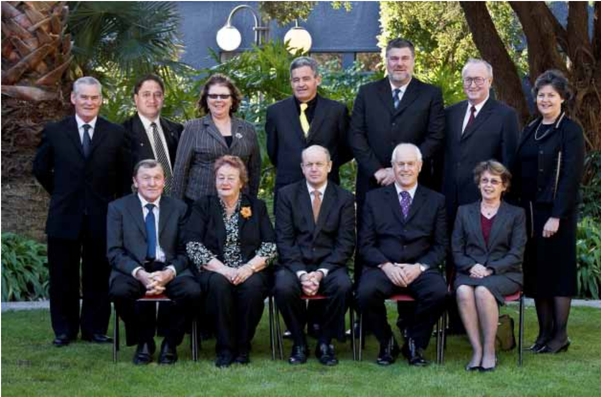
Whakatane District Council 2004-2007