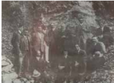
WHAKATANE COUNTY COUNCIL, 1908