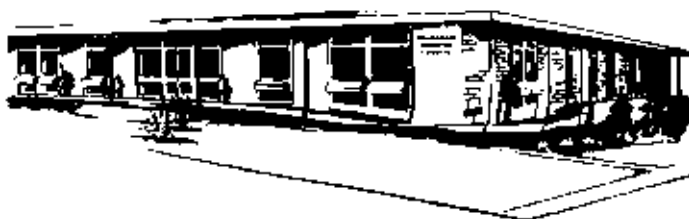
Whakatane District Council