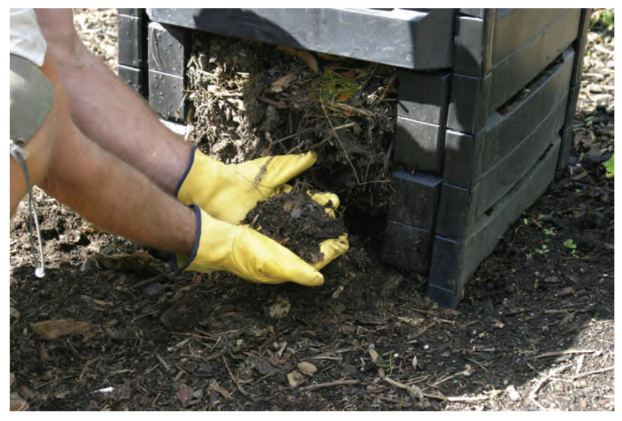
Mature compost, ready for use