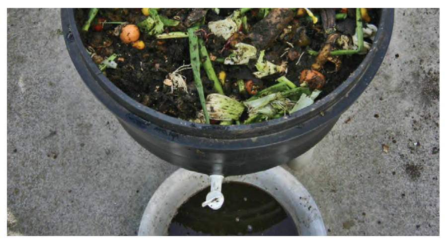
View from the top with worm tea in bucket below