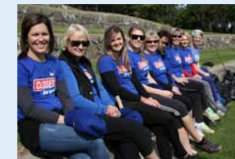
Pictured here, the BNZ Closed for Good volunteer crew takes a well-deserved morning tea break at Whakatāne's riverbank amphitheatre.

Once a year, BNZ branches across New Zealand close their doors and head out to do some good deeds in their local communities. This week, staff from the Whakatāne BNZ branch got their hands dirty and helped to clean up rubbish from the Whakatāne River's banks. While the men were helping shovel dirt at the new Baptist Church, the BNZ Whakatāne women were making their way along the river, clearing rubbish from the bridge to the Heads.