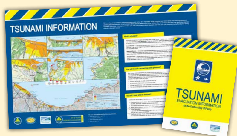
The Tsunami Information Board and Tsunami Evacuation Information Booklet - get your copy now.

The tsunami evacuation information booklets have been made available from our offices, website and other council facilities. Eastern Bay residents can expect to see more developments to help better inform people about what to do and where to go in the event of a tsunami. Over the coming months, both councils will be installing information boards at major coastal access points and will be placing evacuation signage on key routes.