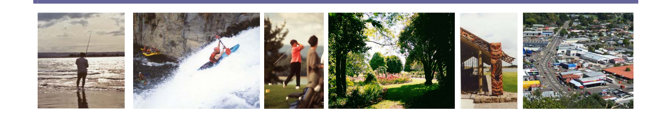
Section 4 - Community Outcomes