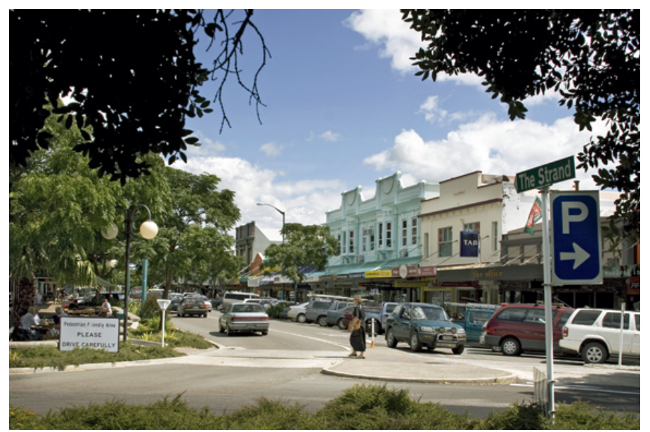
Downtown Whakatane - The Strand

There have been no significant changes in the accounting policies, which have been applied on bases consistent with previous years.