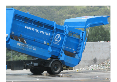
Recycling truck deposits glass bottles at Recycling Park