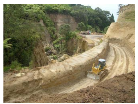
Herepuru Road under construction