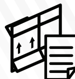
CARDBOARD PEPAMĀRŌ PAPER PEPA