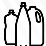
PLASTICS 1 & 2 KIRIHOU 1 & 2