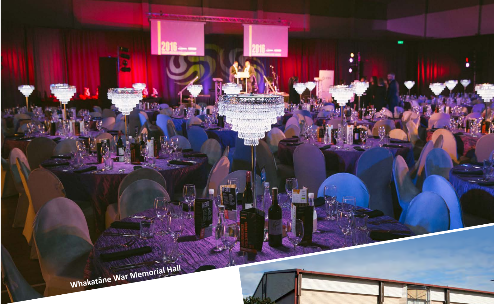
Whakatāne War Memorial Hall