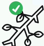
Small branches and twigs