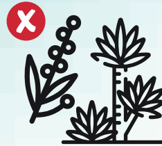
Fibrous leaves like flax, palms and yucca*