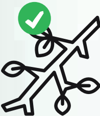
Small branches and twigs