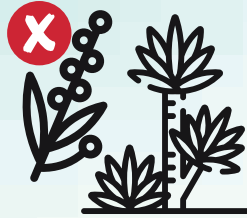
Fibrous leaves like flax, palms and yucca*