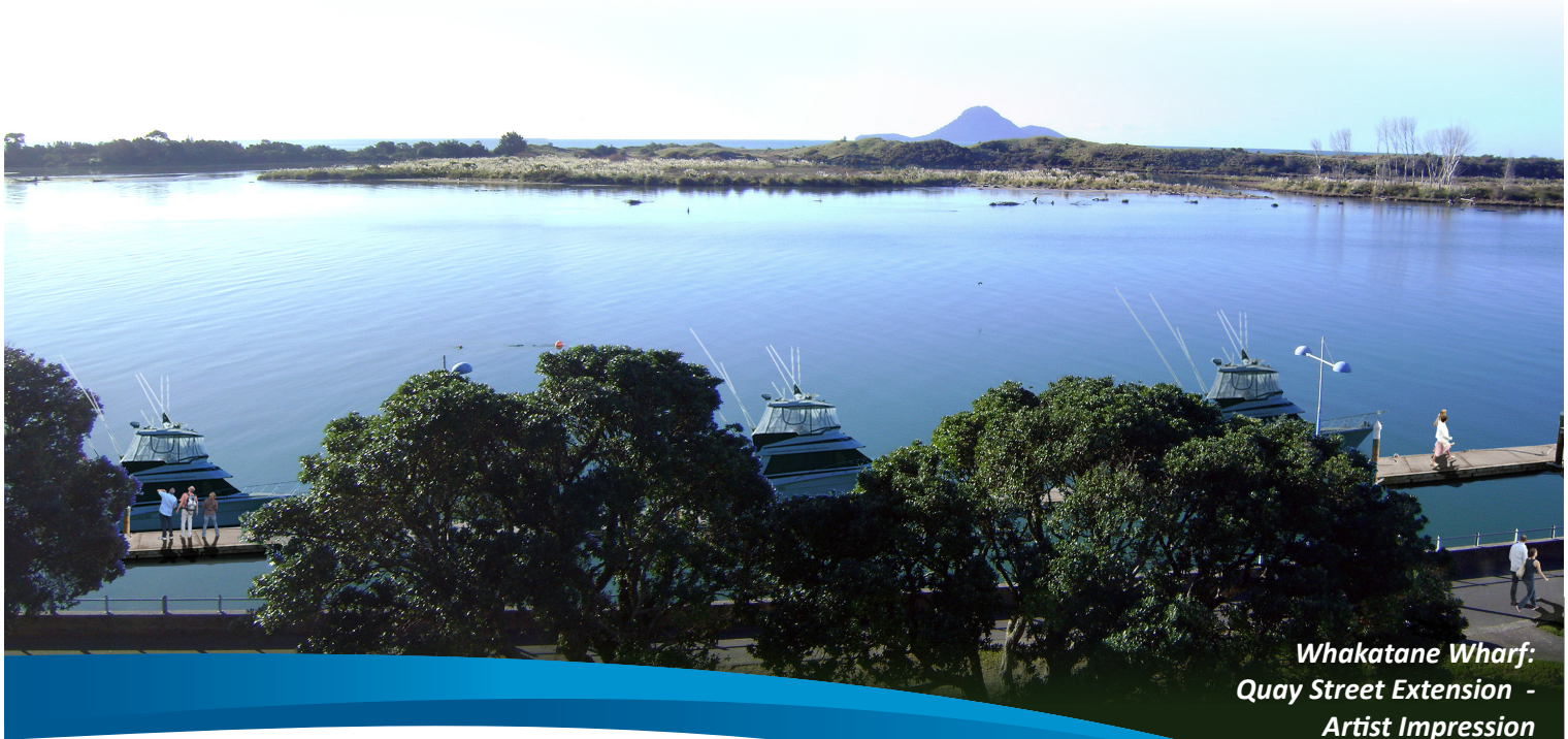
Whakatane Wharf: Quay Street Extension - Artist Impression