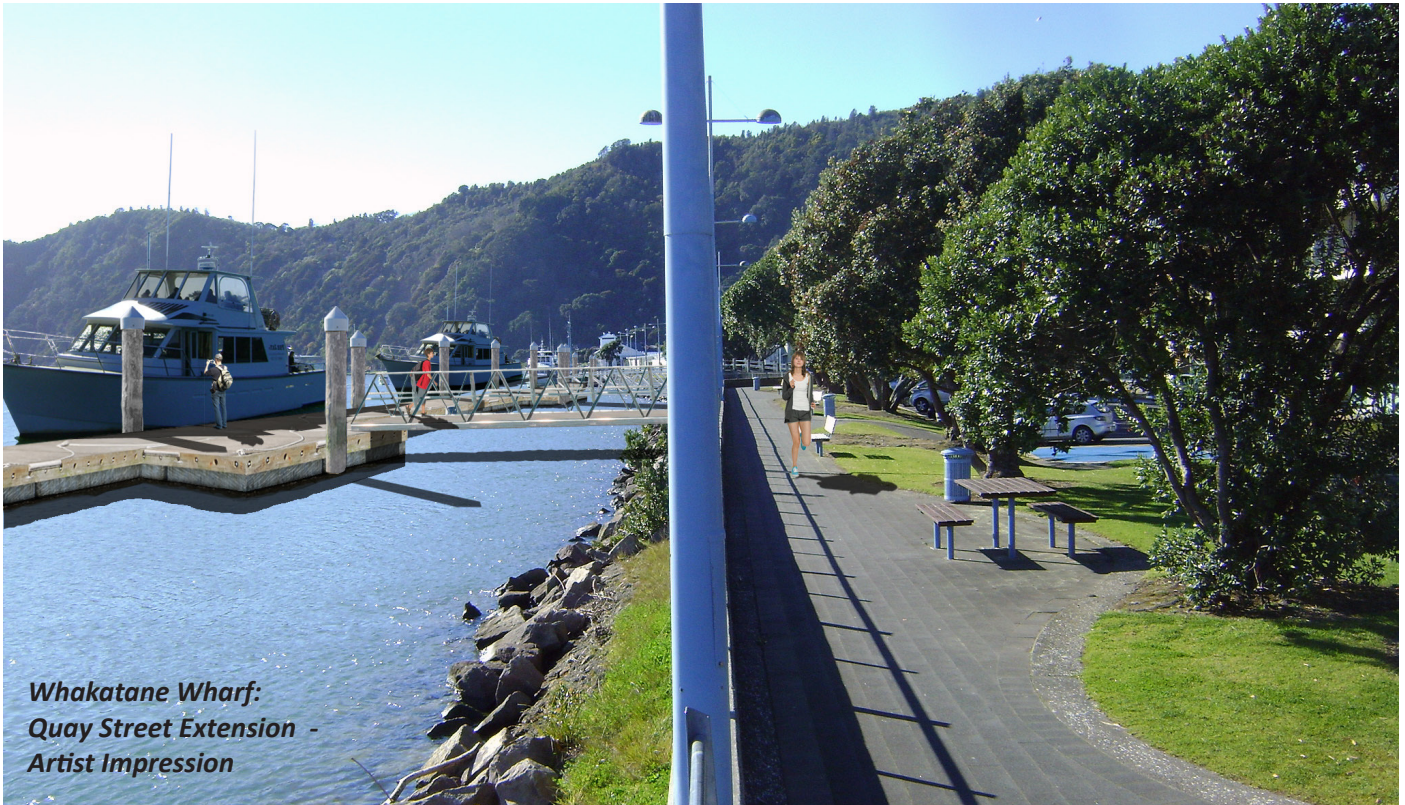
Whakatane Wharf: Quay Street Extension - Artist Impression